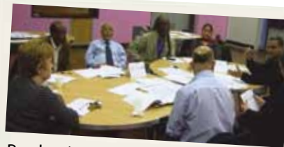
Production of Highfields Area Plan (March 2012)