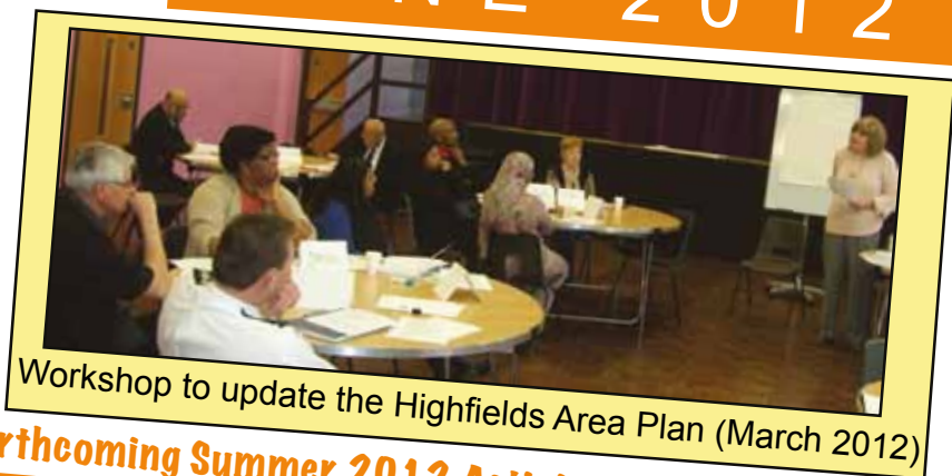
Workshop to update the Highfields Area Plan (March 2012)

The return to a one Highfields Centre service continued with the transfer of the Highfields Multi-Access Centre service to the Association on 1st May 2012 and we're well placed to respond to the City Council's likely decision in the next few weeks to seek external agencies to provide some of its current children and young people's services. As with all major change initiatives and whilst welcoming the Council's proposal to commission services locally, we will have to maintain a close vigilance, especially the proposed ending of their funding for the After School Care service and the amount of funding to be made available for the locally commissioned services. Already, a petition with over 2,700 local signatures objecting to the proposed withdrawal of