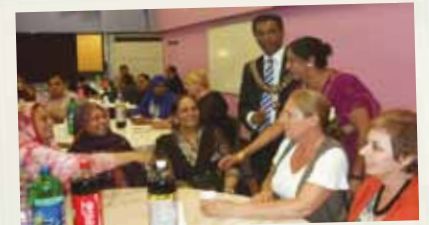
Celebration of ex-HCA Chair Cllr Abdul Osman's appointment as Lord Mayor (June 2012)