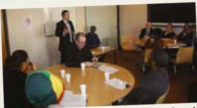
Launch of Future Jobs Fund Evaluation Report with Jon Ashworth, MP (October 2011)