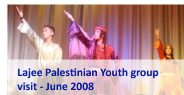
Lajee Palestinian Youth group visit - June 2008