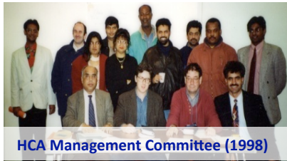
HCA Management Committee (1998)