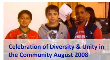
Celebration of Diversity & Unity in the Community August 2008