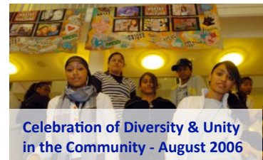
Celebration of Diversity & Unity in the Community - August 2006