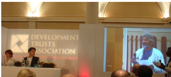
Development Trusts Association, National Conference, Leeds Sept 2008. Hazel Blears, Government Minister and Priya Thamotheram in a panel discussion.