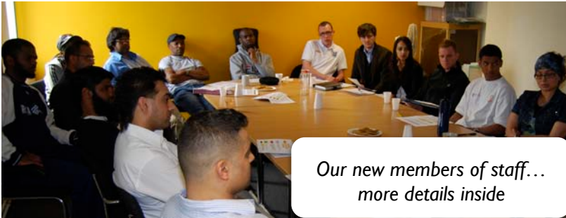
Our new members of staff... more details inside

Local facilities for Highfields Communities