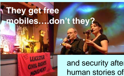
They get free mobiles....don't they?