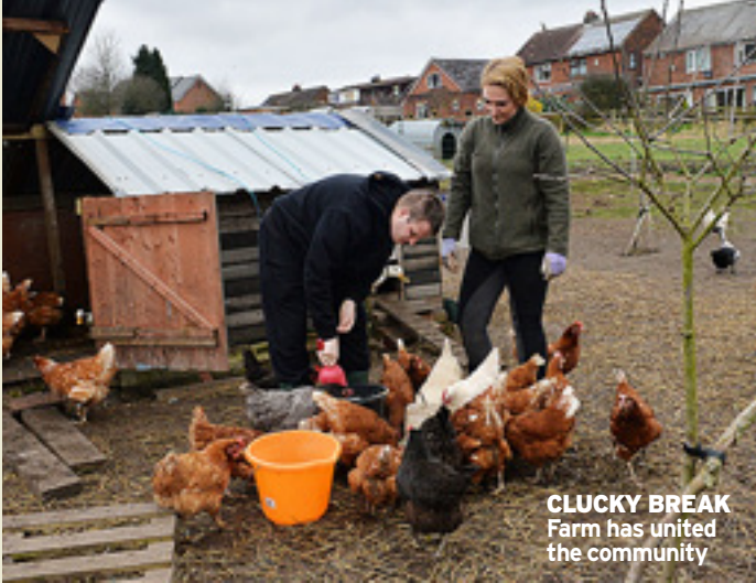
CLUCKY BREAK Farm has united the community