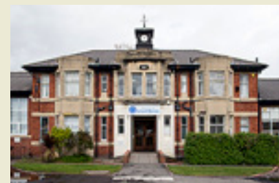
COMMUNITY MAGNET Linskill Centre

"The whole point is to bring people together under one roof."