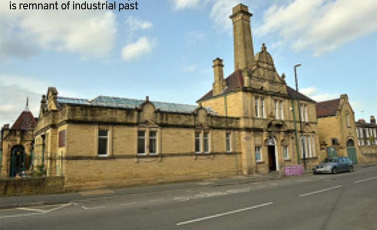
LANDMARK Tall chimney is remnant of industrial past

DOMINATING the skyline, the towering old foundry chimney is a well-known city landmark.