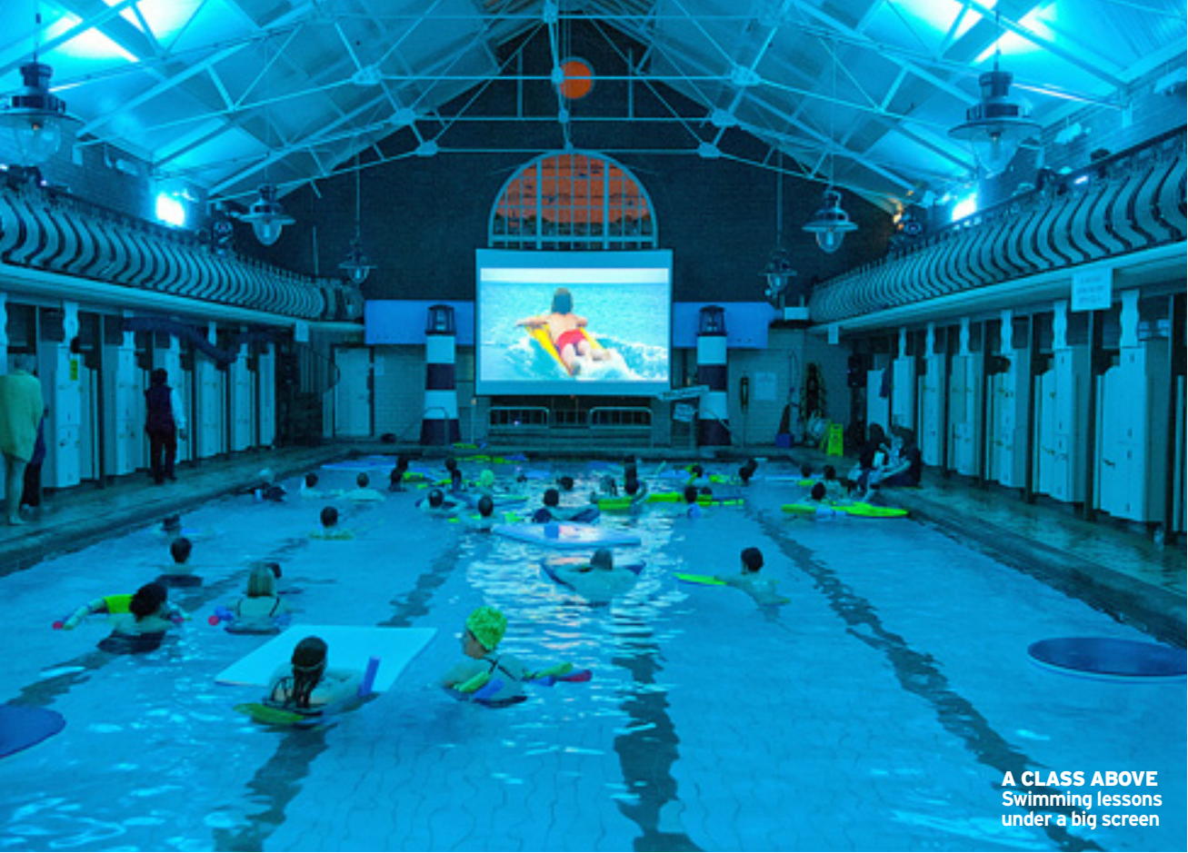
A CLASS ABOVE Swimming lessons under a big screen

He said: "We took over the sports centre on the Sunday. And it was in a bad way. It was the biggest area of anti-social behaviour. The kids used to hang round, there were police cameras, security, it was a flashpoint. "We got the keys on a Sunday night. Monday morning, local people went in, and the kids turned up. They were saying, 'What are you doing here?' "And the people who had come were saying 'Get out of here or I'll tell your mam...' And off they went. "We didn't need any security guards or anything. "Then eventually we got the kids back in. Charging 50p, putting classes on. Anti-social behaviour disappeared overnight."