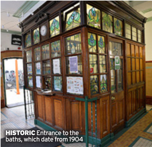
HISTORIC Entrance to the baths, which date from 1904