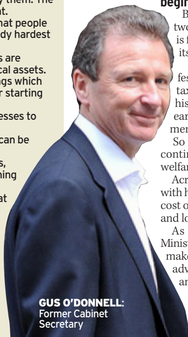
GUS O'DONNELL: Former Cabinet Secretary

YouGov surveyed 4,265 adults for the poll in February.