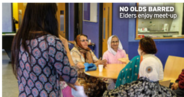
NO OLDS BARRED Elders enjoy meet-up