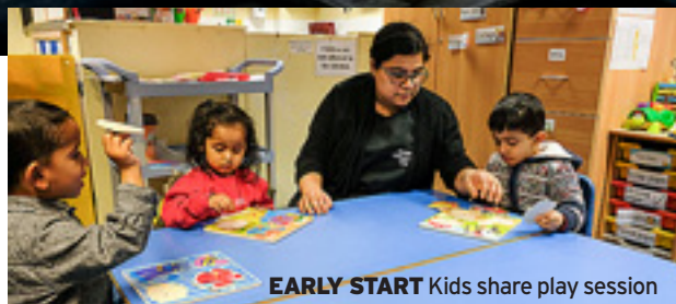
EARLY START Kids share play session