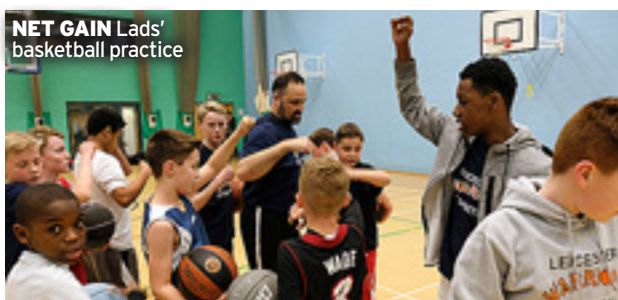
NET GAIN Lads' basketball practice

IN the middle of a sprawling inner-city council estate, community elders hunch over pool tables and PlayStations - the joy of this first encounter lighting up their faces.