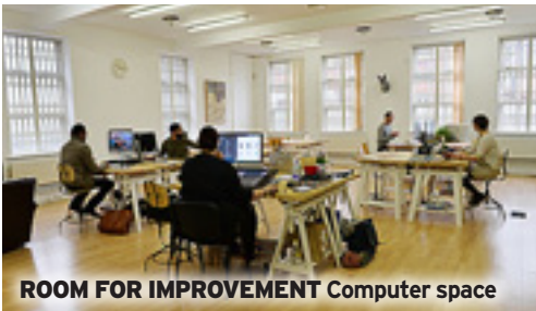
ROOM FOR IMPROVEMENT Computer space

“When our daughter was young she started dancing as part of a group. She appeared on the stage here in the main hall. We used to come and watch her. We’ve always had connections with