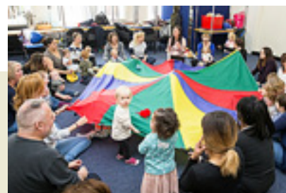
CHILD'S PLAY Mums & toddlers at Linskill

Get together with people. You're not going to do it on your own. Don't get overwhelmed at the start. If everyone thought about what they were taking on they wouldn't get going. Take it one step at a time.