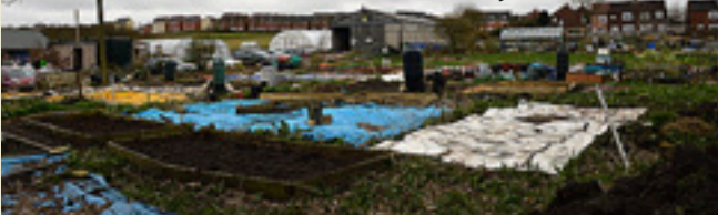
GROW FOR IT Allotment and farm learner, right